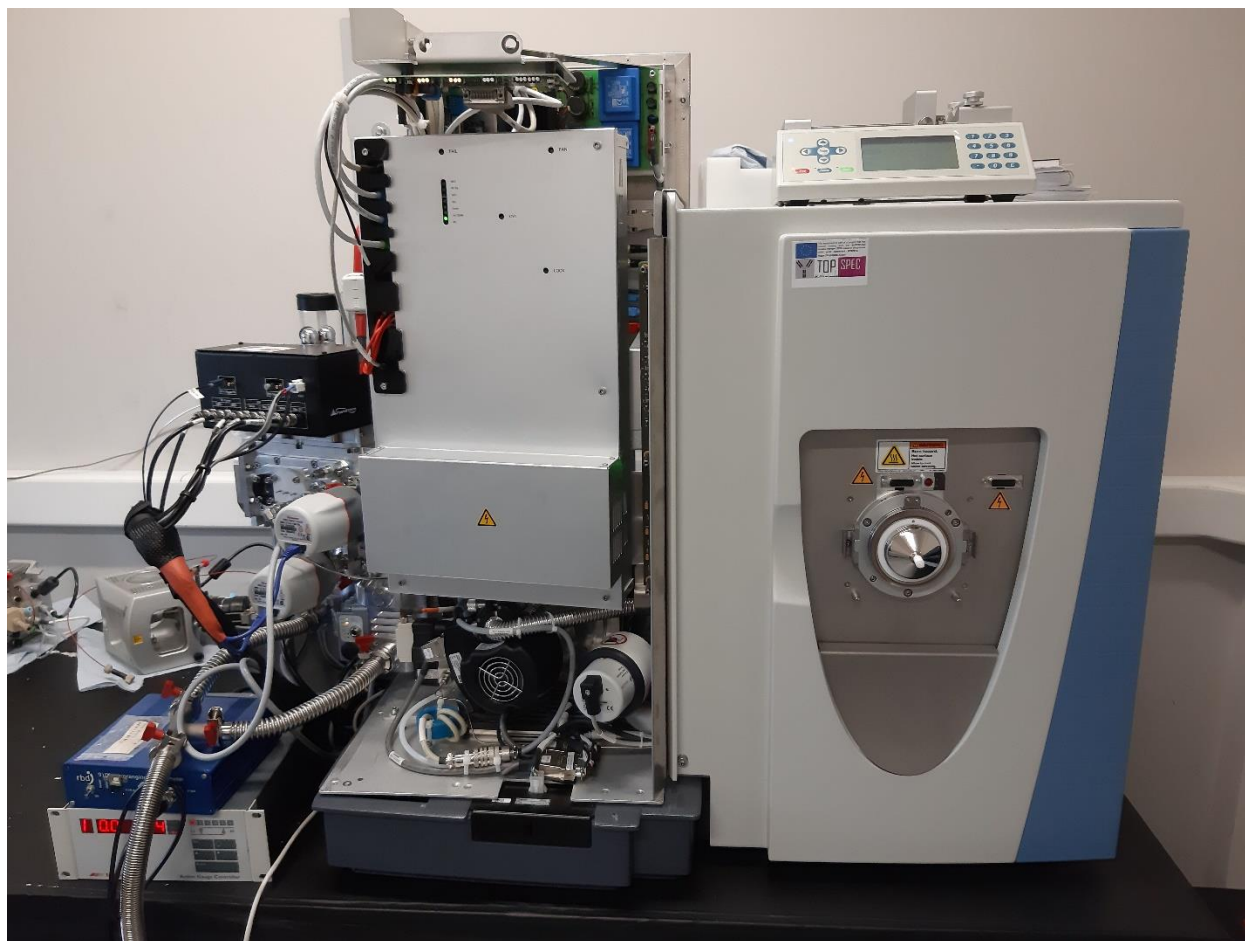
Figure 2. Q Exactive HF interfaced with the Omnitrap.